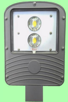
45 Watt Eco plus