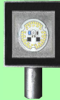
18 Watt Eco